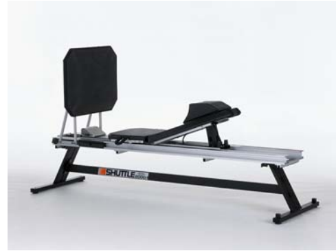
Adjustable Backrest Basic